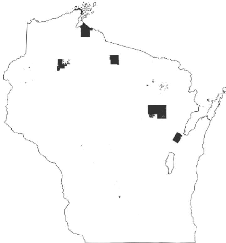
Figure 1 – Native American Tribal Area

Note: See the US Census Bureau for more information about AIANNAH communities at https://www.census.gov/programs-surveys/geography/technical-documentation/records-layout/2020-aiannh-record-layout.html